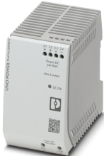
Primary-switched UNO POWER power supply for DIN rail mounting, input: 2-phase, output: 24 V DC/90 W

Please be informed that the data shown in this PDF Document is generated from our Online Catalog. Please find the complete data in the user's documentation. Our General Terms of Use for Downloads are valid ( http://phoenixcontact.com/download )