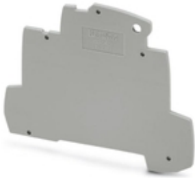
End cover for terminating a row of TERMITRAB complete TTC-6... terminal blocks

Please be informed that the data shown in this PDF Document is generated from our Online Catalog. Please find the complete data in the user's documentation. Our General Terms of Use for Downloads are valid ( http://phoenixcontact.com/download )