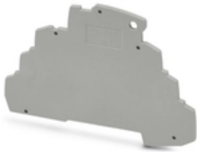
End cover for terminating a row of TERMITRAB complete TTC-3... terminal blocks

Please be informed that the data shown in this PDF Document is generated from our Online Catalog. Please find the complete data in the user's documentation. Our General Terms of Use for Downloads are valid ( http://phoenixcontact.com/download )